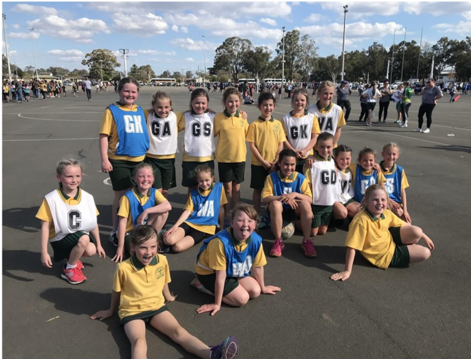
9 Years teams