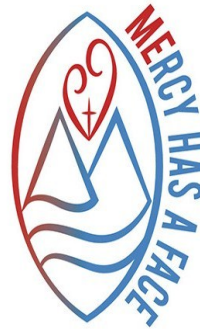
Diocese of Parramatta Logo