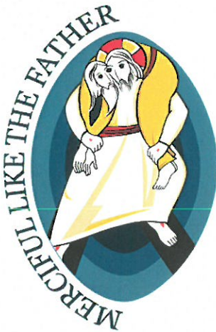
Year of Mercy Logo