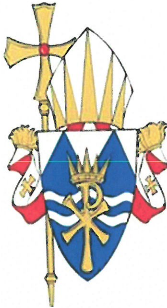
Parramatta Diocesan Crest