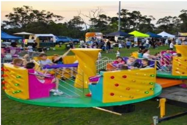
The Storm Ride

Pre-Purchase Unlimited Rides - $25.00 each SAVE $5.00! Rides include: