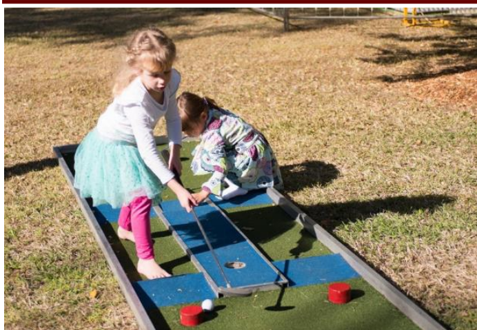
Mini Putt Putt Golf