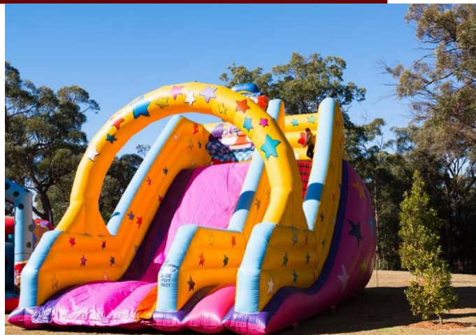
Giant Inflatable Slide