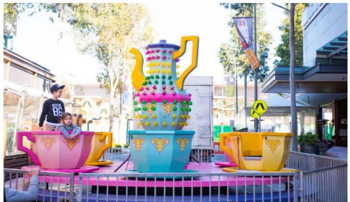
Cups and Saucers