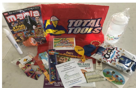
Boy's Show Bag

CRAFT STALL – We would appreciate donations of the following items to use on fete day: ribbon, buttons, beads, material, wool, pom poms, googly eyes, shells, fishing line, timber pegs, pipe cleaners, craft kits, wash tape, tulle, card paper stock... These can be taken to the office or contact Sonya Peters, smmpfete2018@gmail.com