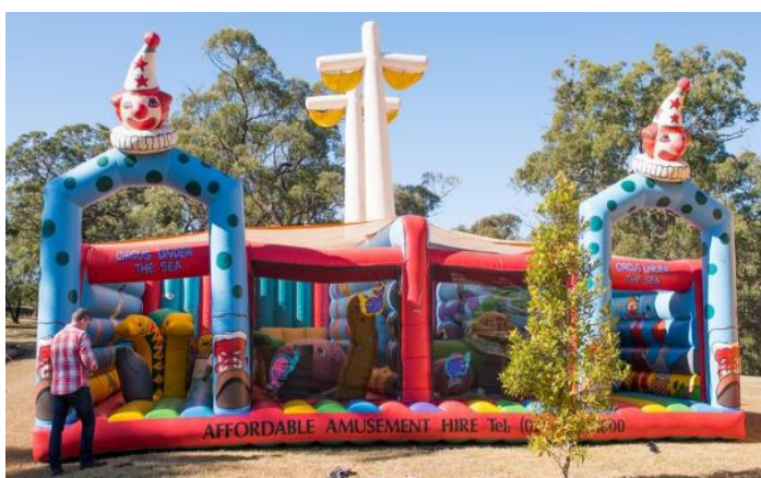
Circus Under the Sea