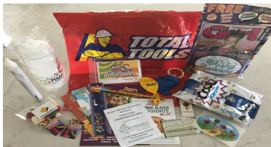
Girl's Show Bag

Pre-Purchase Show Bags - $5.00 to guarantee your show bag! Show bags include: